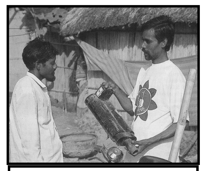
A mistry installs the pump and is often a convincing salesman, as he knows the farmers very well.

drillers, or mistris are village mechanics who install Treadle Pumps. It is critical that they install each pump correctly if it is to work effectively. If the sand layer in the well that the Treadle Pump pumps from is not developed properly, for example, the pump will be hard to operate and will